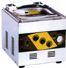
SC/25 SC/30 SC/35 SC/40 SC/45